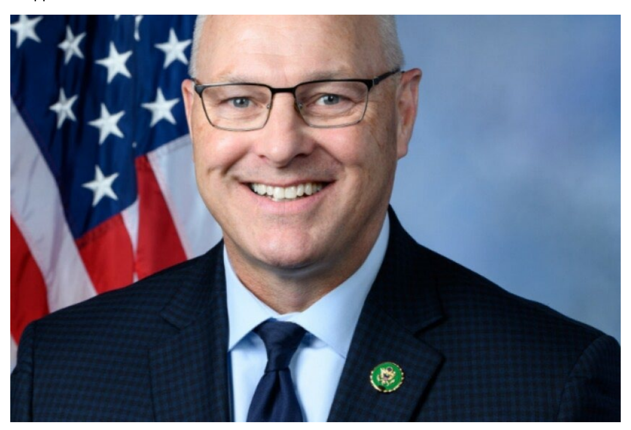
U.S. Rep. Pete Stauber

The act, introduced by Rep. Pete Stauber, would exchange 36.7 acres owned by the Bowen Lodge resort in Deer River for 17.5 acres managed by the U.S. Forest Service and the Chippewa National Forest.